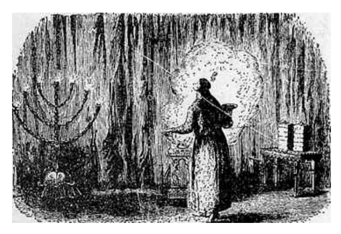
The Holy Place

The Table of Shewbread was placed on the North side of the apartment so as to be on the right hand of the priest when he walked up towards the second veil. Twelve loaves of unleavened bread were continually kept upon this table. They were placed in two piles, one loaf upon the other, and on top of each pile there was a small quantity of frankincense These loaves were called Shewbread or bread of the face, because they were set solemnly forth before the presence of the Lord, who dwelt in the Shekinah Glory behind the second veil. Every Sabbath day these loaves were changed by the priests, the old ones being taken away and new ones put in their place. The bread that was taken away was given to the priests to eat and no one else was allowed to taste it, neither were they suffered to eat it anywhere else except within the court of the Sanctuary, because it was most holy, and therefore might only be taken by sacred persons upon holy ground. The incense that was upon the two piles of shewbread was burned when the bread was changed as an offering by fire unto the Lord for a memorial instead of the bread.