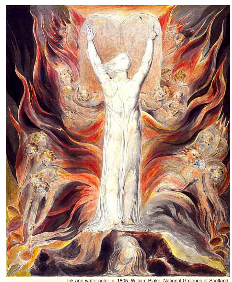
The Finger of God Writing Moses prostrates in dread before the fiery formulation of the Law.

intellect and awakens and unleashes all the dormant powers of the old brain, which explains why it is not possible to tell what a person may do when he is thoroughly frightened. This accounts for the animal-like action under fear—sometimes, in excesses, he becomes insane and sometimes even dies."