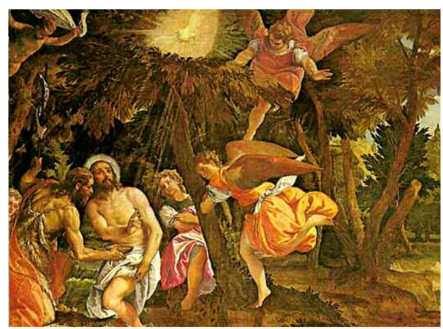
Detail (complete composition includes the Temptation of Christ ), Oil on Canvas, circa 1580, Paolo Veronese, Brera Milan The Baptism

Answer: If you will read the Rosicrucian teachings carefully you will find that a distinction is made between Jesus and Christ. Jesus was a man among men. When we look in the memory of nature we can find His previous lives just the same as other human beings, though He is probably the grandest and most noble soul that ever lived in a human body. But Christ is the highest initiate of the Sun period and had never lived in an earthy body before He took the body of Jesus at the baptism to directly teach men the way to the kingdom of God. Thus both Jesus and Christ are vastly above other grand and noble world