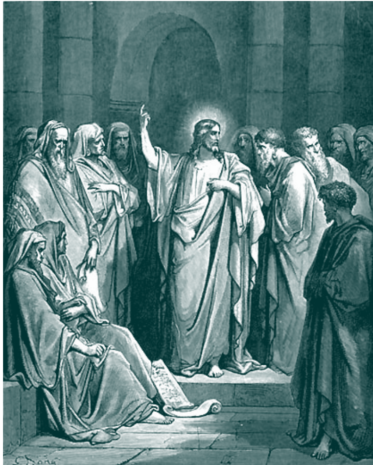
Gustave Dorm (1833-1883)

Having received the instrument of mind in the Atlantean Epoch, the human soul is called to use the cognitive faculty to establish its individual identity