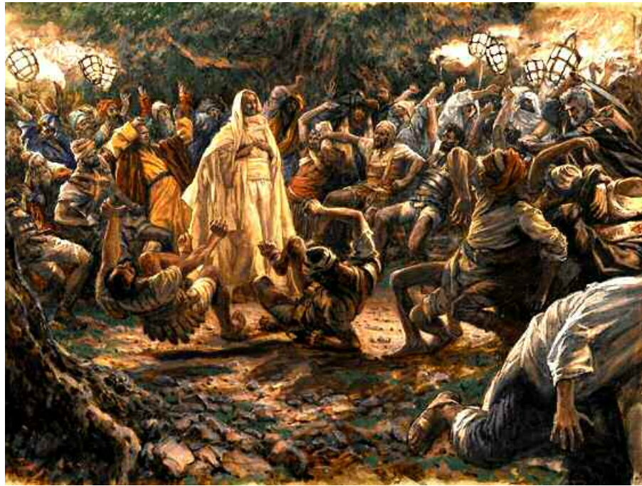
Watercolor, J. James Tissot (1836-1902), Brooklyn Museum

refusing to employ them, Christ Jesus frustrated the expectations of His friends and confounded his enemies. Upon identifying himself in Gethsemane as the one they were seeking with the words, “I am he” (John 18:6), they fell backwards as if struck by lightning—scarcely surprising when we realize that the incarnate Solar Logos is identifying Himself. Earlier, before his outraged listeners, Christ proclaimed that “Before Abraham was, I am” (John 8:58). In this imperial declaration we discover the source of the authentic authority that Christ bestows upon humanity as its archetypal Ego. The ego is the focus of the human spirit’s consciousness. The Christing of the ego has its pale reflection in the coronation of a king. But with this difference: