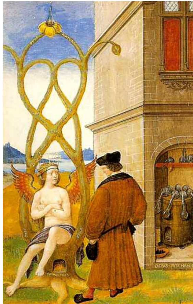
Miniature, Jehan Perréal, 1516, court of Margaretha of Austria, Musée Marmottan, Paris

There are many who, realizing the possibility of producing this spiritual gold, set out enthusiastically to accomplish the Great Work, overnight as it were. They eagerly attend every meeting they can, read occult books, wade through courses in philosophy. Yet when it comes to their being asked to throw in all of their life resources into the crucible which produces and accomplishes the Great Work, by giving up many of their habits, pleasures, pur-