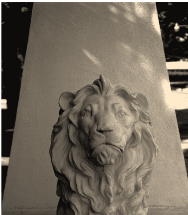
One of the two lions flanking the main entrance to the Rosicrucian Fellowship Headquarters (Mount Ecclesia). The sign of Leo represents those ideals humanity aspires to during the time (2156 years) Aquarius is precessing the equator.

Is the Rosicrucian Fellowship student engaged in occult or mystic study? The Cosmo tells us. Its first sentence in "A Word to the Wise" begins with these words: "The founder of the Christian