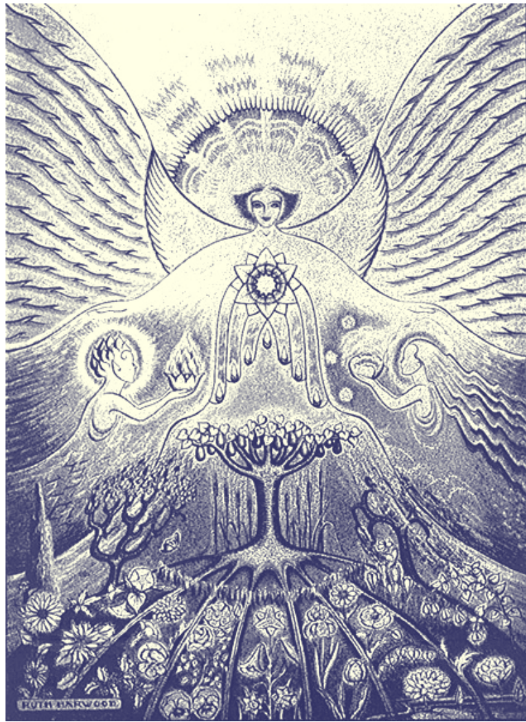
The fire of desire and the water of feeling will eventually be balanced and unified and the doer will cease to objectify in the physical world as a divided self in male and female forms, no longer in thrall to the senses.

Now what happened during the thinking to free it from its attachment? Thinking is the steady hold-