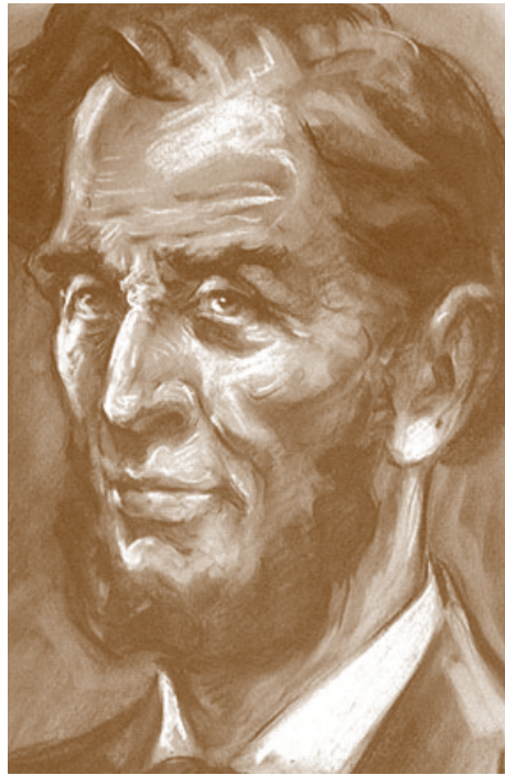
Abraham Lincoln displayed positive Saturnian and Capricornian traits. He had a strong sense of both personal and national destiny, based on a deep moral intuition of the rule of the All-Good.

All Capricorn natives become positively endowed with permanent place and power as they align