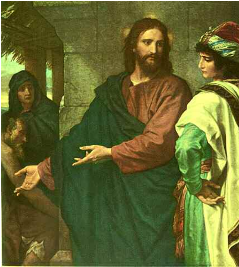
Heinrich Hofmann (1824-1911), Riverside Church, New York City

Pisces is the sign of the feet. Pisces is also the sign of experience, as the result of which we learn