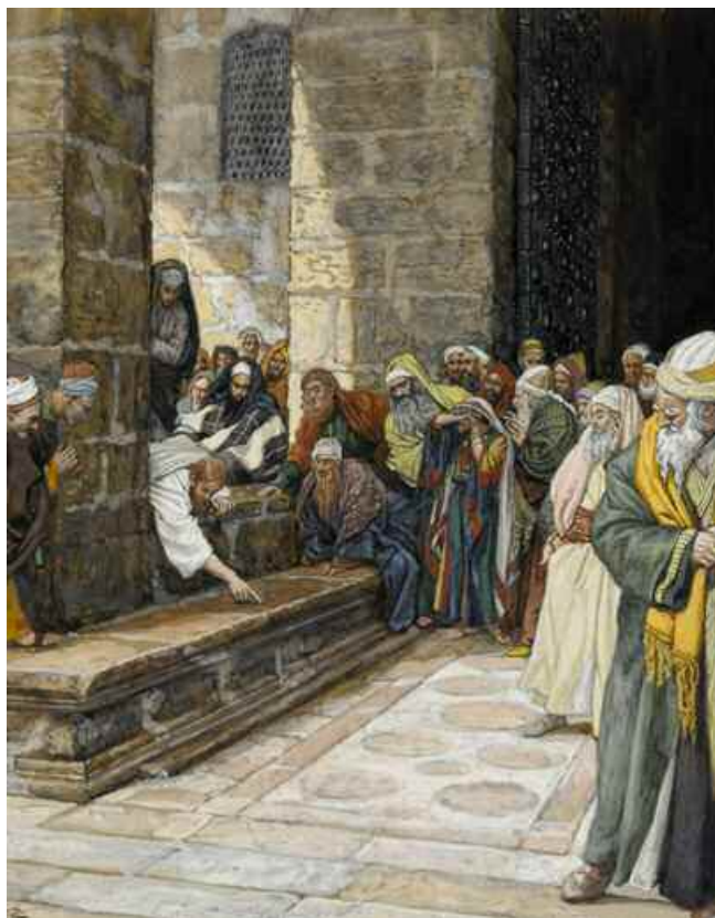
Watercolor, J. James Tissot (1836-1902)

In those early days when the religions of the east were given to humanity, mankind was still more spiritual in nature than the material beings of the present-day Western World. They knew that we live many lives in different shapes and forms here upon this Earth. In the East today they are yet thoroughly imbued with that idea, and as a consequence they are exceedingly indolent. They are more concerned with thoughts of Nirvana—the invisible world—where they may rest in peace and joy, than with taking advantage of their present